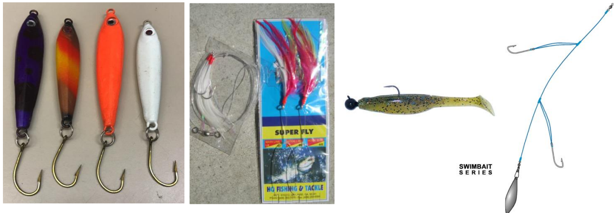
Gear types used in this study. Note that not all gear types are used in all locations. Left to Right: Lingcod bars in various sizes, shrimp flies (unbaited and baited with squid mantle), swimbaits, and dropper loops (baited with squid mantle).

At the beginning of every CCFRP cruise, volunteer anglers are assigned a fishing station, which is organized by gear type. Gear types were selected to reflect gear commonly used in that region, thus it varies slightly among sampling groups. The North region gear type includes swimbaits with a shrimp fly teaser, lead bars with a shrimp fly teaser, baited shrimp fly lures, and unbaited shrimp fly lures; Central region gear type includes lead bars with a shrimp fly teaser, baited shrimp fly lures, and unbaited shrimp fly lures; South region gear type includes swimbaits, baited dropper loop lures, and baited shrimp fly lures. Note that all hooks are crimped to promote survivorship.